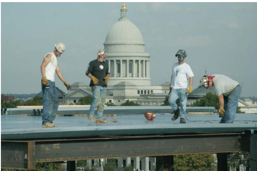
Construction workers have a great view from the area above the ACH cafeteria as they work on the future offices for administration.