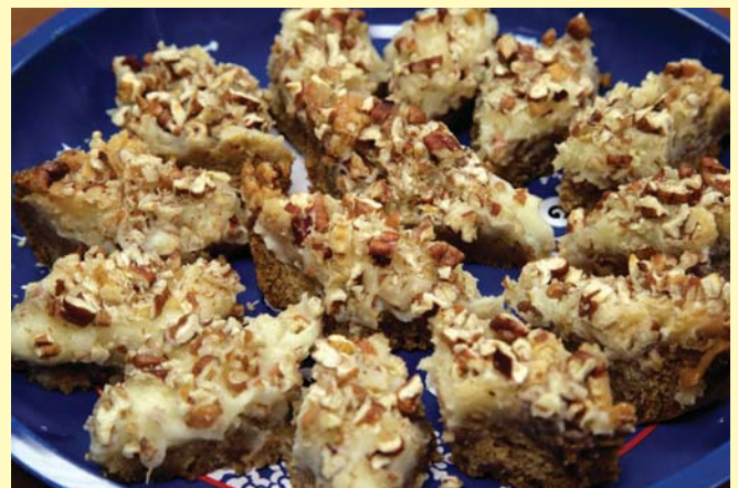
(Below, right) Butter pecan cheesecake brownies baked by Aaron Walters shared the runner-up position.