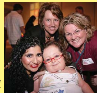
A former PICU patient catches up with some of the PICU team that attended the festivities.