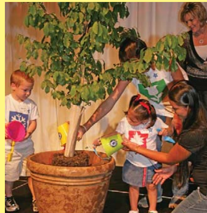
Former PICU patients planted a ceremonial tree to be placed on the ACH campus in the future.