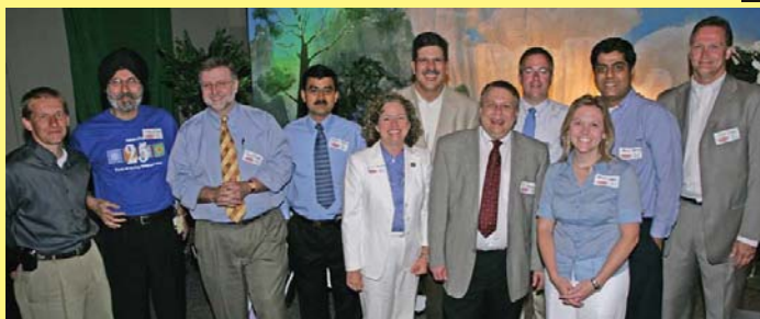
PICU physicians past and present.